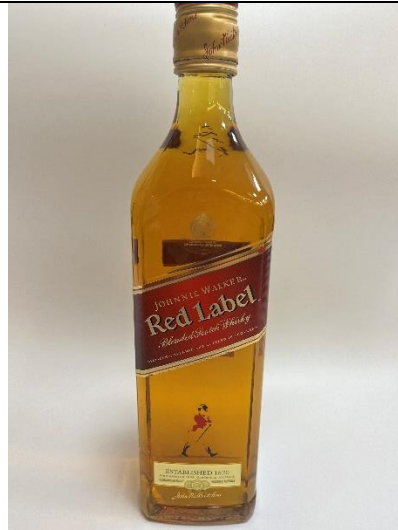
A2 Blended Scotch Whisky