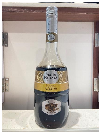
A18 Crème de Café