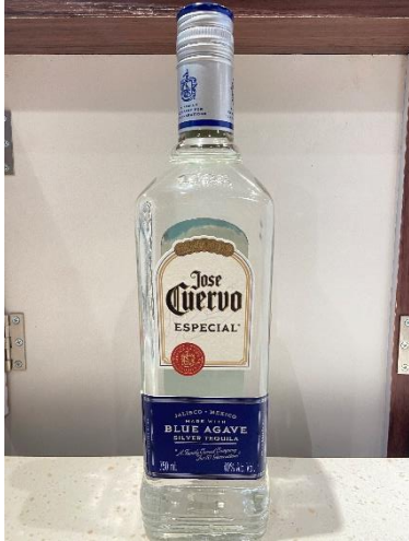
A7 Tequila(Color is an option)