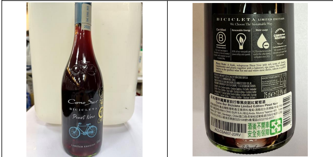
A21 Pinot Noir 產國: 智利 年分:2020