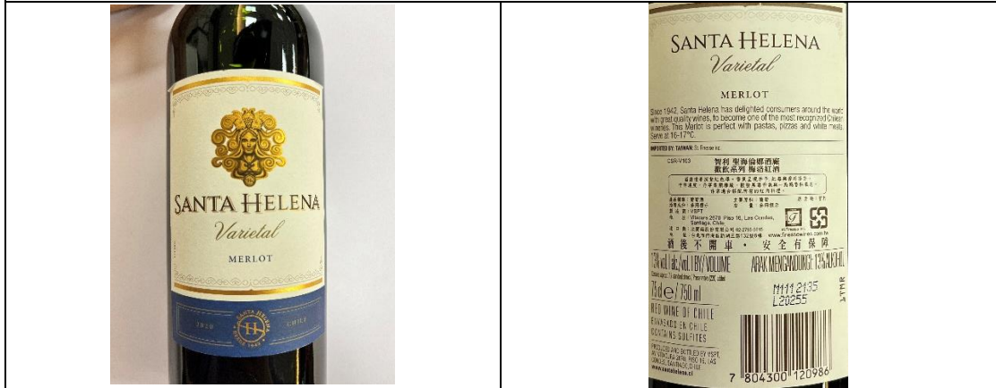
A20 Merlot 產國: 智利 年分:2020