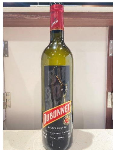
A12 Dubonnet Red