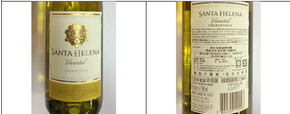
A23 Chardonnay 產國:智利 年分:2021