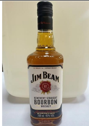
A4 Bourbon Whiskey