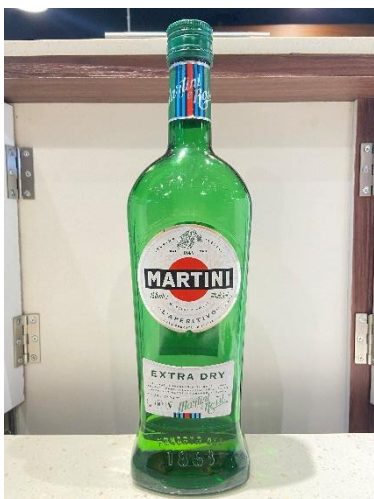
A11 Dry Vermouth