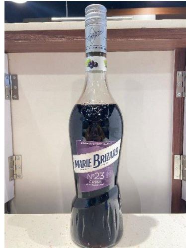
A14 Crème de Cassis