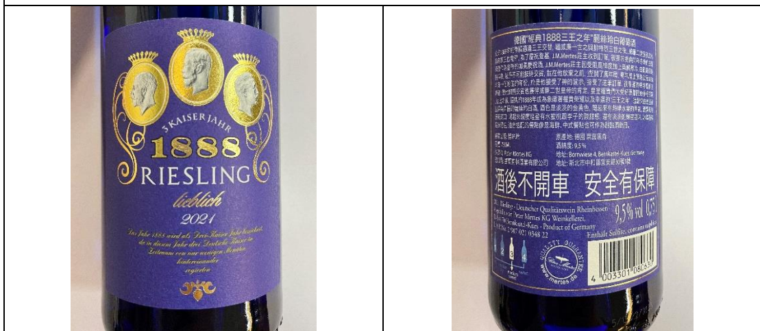
A24 Riesling 產國:德國 年分:2021