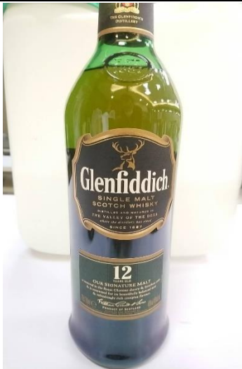
A3 Single malt Scotch Whisky