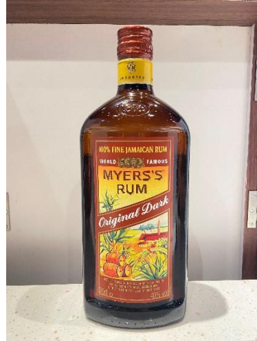
A8 Dark Rum