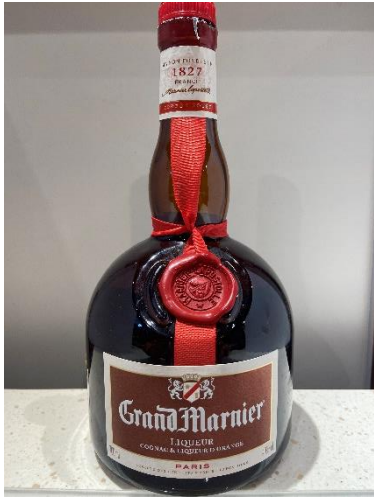
A13 Grand Marnier