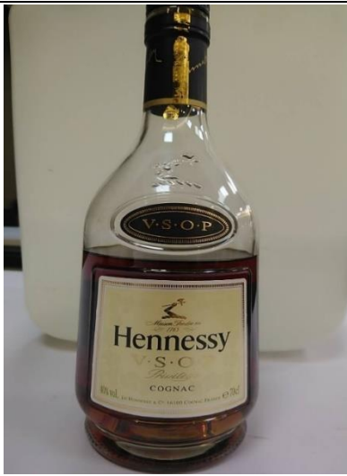
A1 Cognac V.S.O.P.