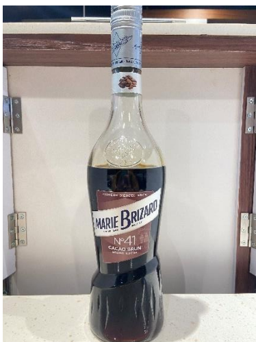
A17 Brown Crème de Cacao