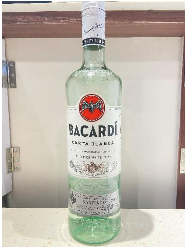
A9 White Rum